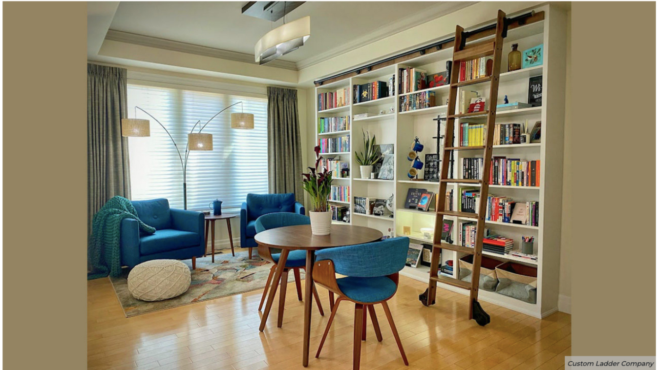
Custom Ladder Company

There's something undeniably romantic about a rolling library ladder.