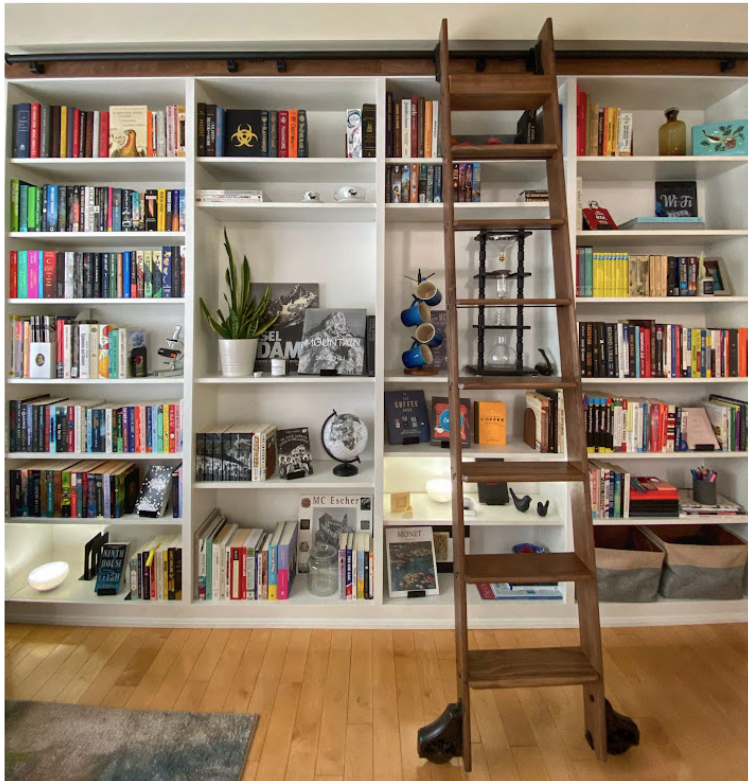
Custom Ladder Company's Walnut ladder.